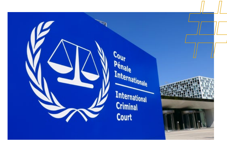
The Hague-based ICC investigates and tries individuals charged with the most serious crimes committed in the international community

The International Criminal Court ('ICC') is an international court based in The Hague. It investigates and tries individuals charged with the most serious crimes committed in the international community: genocide, war crimes, crimes against humanity and the crime of aggression. It was set up in 2002 under the auspices of the Rome Statute, a multilateral treaty that serves as the court's governing document. To date, the ICC has 123 member states, including Afghanistan. However, the United States is not a member of the court or a party to the Rome Statute.